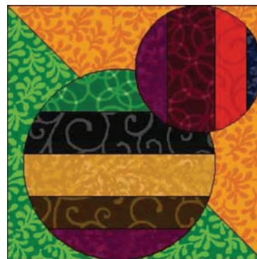
Example of Finished Block

12. From 466RO, cut (6) 2 1/4" binding strips. Sew the strips end to end. Use the long strip to bind the edges to finish.